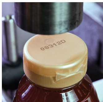
Ink jet code on top of plastic bottle