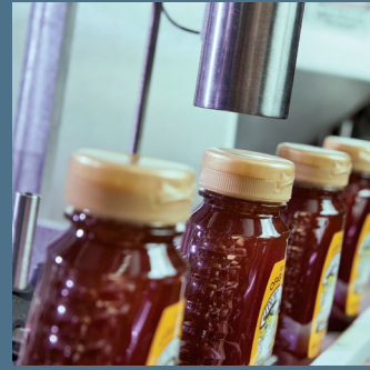
Videojet 1510 printing on-line

Dutch Gold Honey continues to see more and more coding requirements every year and is able to meet customers’ needs as they change. The CLARISUITE system allows them to expand and gives them the comfort to know that all the information is correct and will meet their customers’ needs.